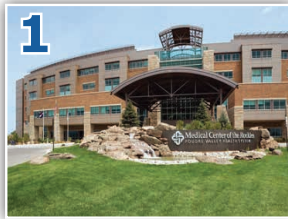
Medical Center of the Rockies - Regional Hospital