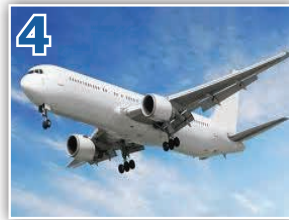
Northern Colorado Regional Airport