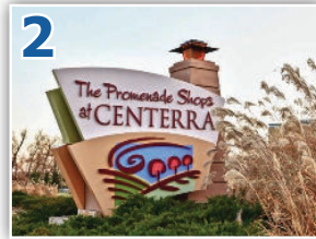
Promenade Shops at Centerra - 700,000 sf Lifestyle Center