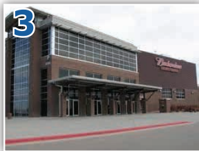
Budweiser Events Center 7,000 seat Event Center